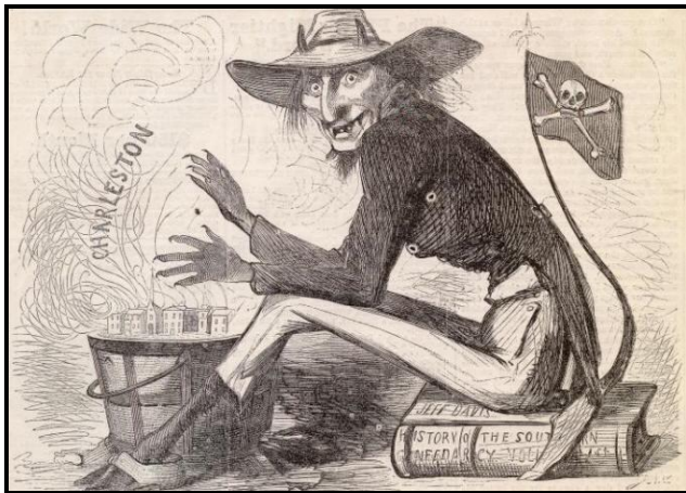
Jefferson Davis sitting on his book, "History of the Confederacy," and warming on Charleston burning.