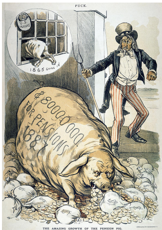
"The Amazing Growth of the Pension Pig"