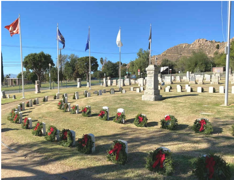
Above; Wreath adorn the headstones of the Civil War Veterans interred at the G.A.R. Circle at Evergreen Cemetery 12/16/2023.