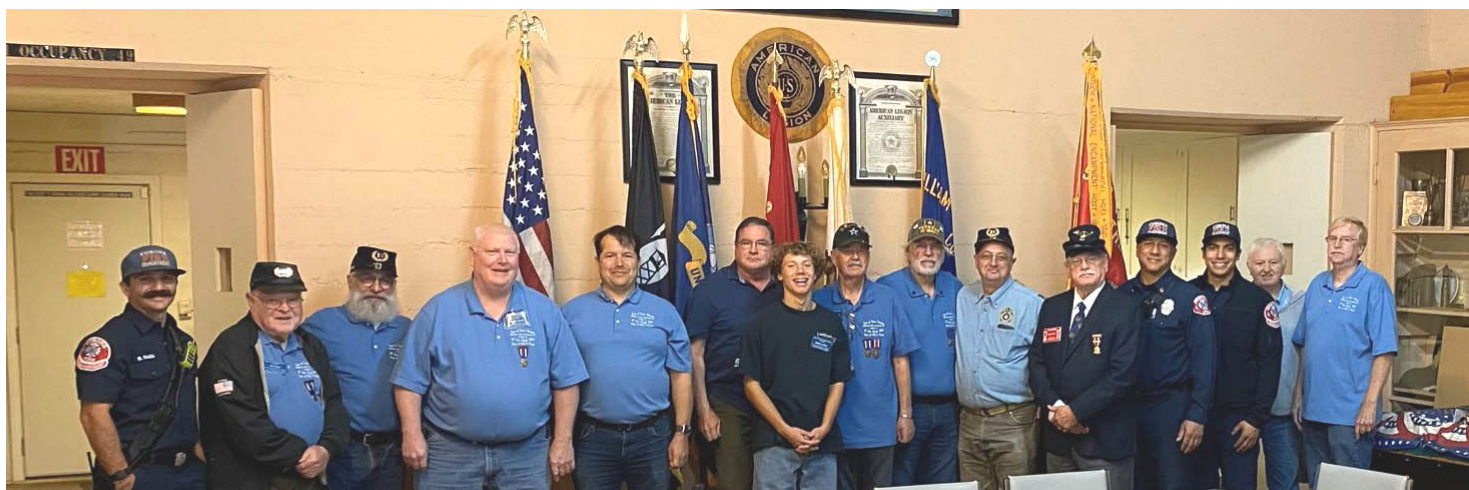
Photo above; Camp 18 Brothers attending the Holiday/Election meeting with 3 Corona Fireman coming to pick up the “Toys for Tots” that the Camp collected to help spread the Holiday Cheer to those in need. This is a Great group of guys!