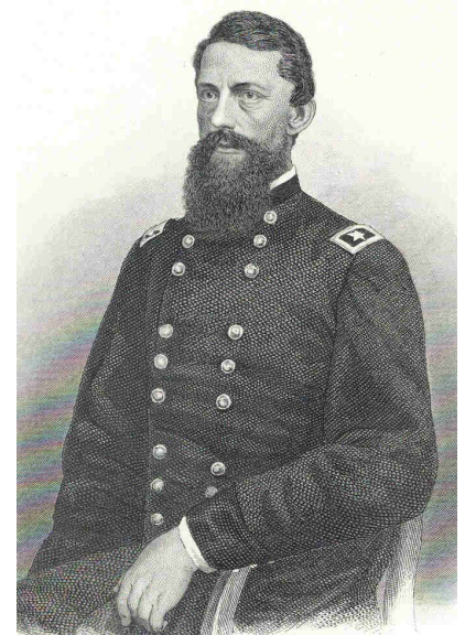
General George Stoneman Jr. Camp 18 Officers