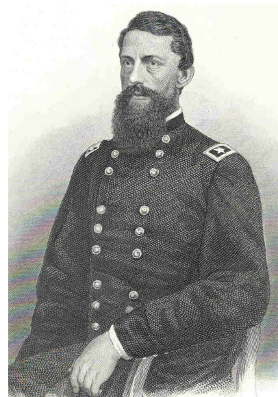
General George Stoneman Jr. Camp 18 Officers