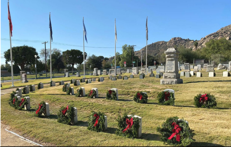
Above; wreaths adorn the Veteran headstones at the G.A.R. Circle in Evergreen Cemetery for the Wreaths Ceremony.