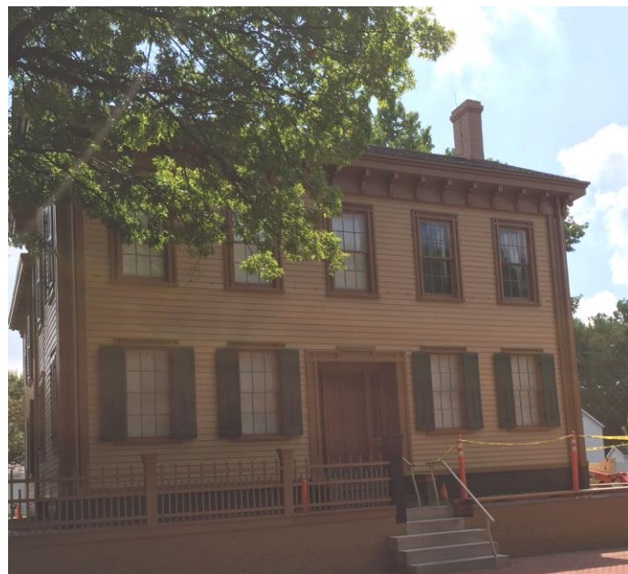
Above; the house where the Lincolns lived before moving to Washington D.C. in 1861. Mary Todd Lincoln did major remodeling to the house while they lived there

Springfield Illinois is truly the "land of Lincoln." It was very enjoyable walking through the souvenir shops (where I picked Lincoln's Presidential License shown lower left) and enjoyable walking through a few of the many museums devoted to our 16 th president but the most exciting experience of the Springfield trip was seeing the restored home of the Lincolns and those of his neighbors, the building were Lincoln and partner had their law practice and the old court house where Lincoln worked.