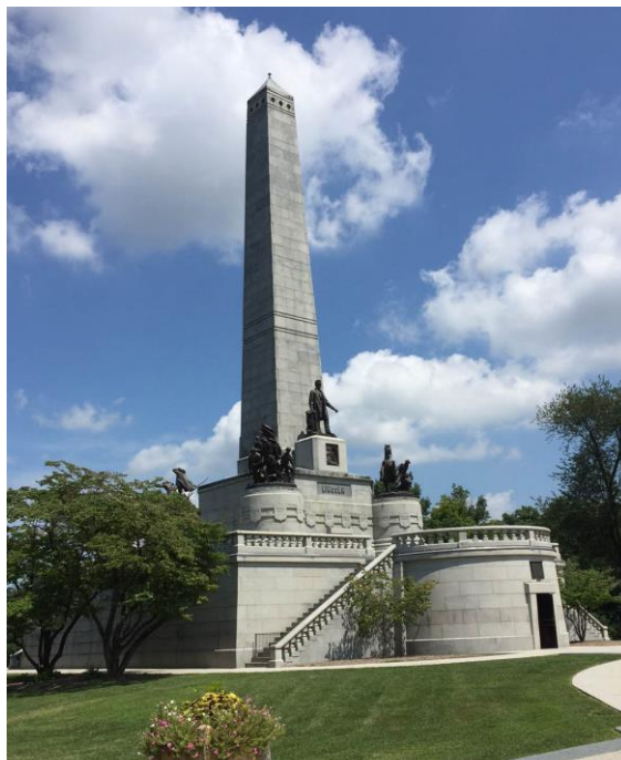
Photo above; the Lincoln Tomb Monument where the 16 th President is entombed just outside of Springfield, Illinois