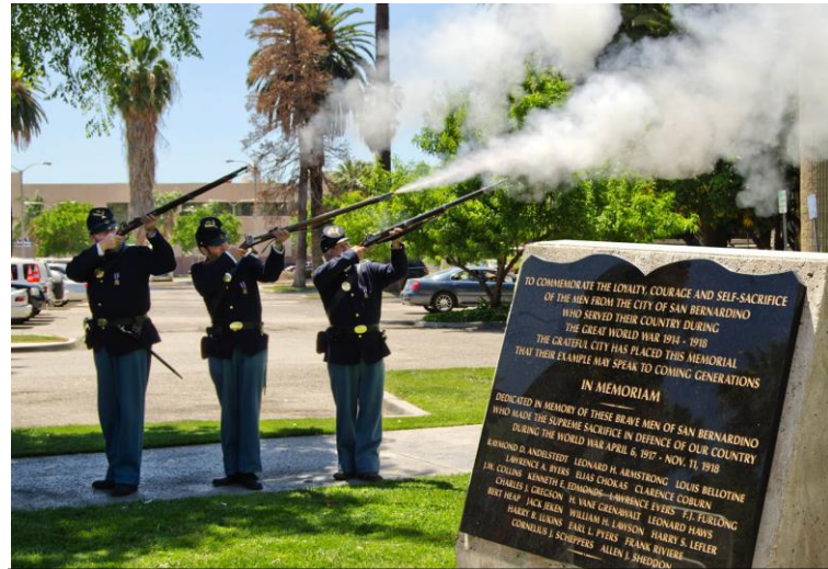
Above, Camp 18 fires a volley in Honor of our Civil War Union Ancestors.