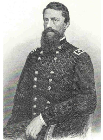
General George Stoneman Jr. Camp 18 Officers