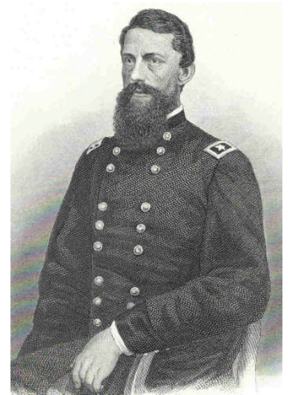
General George Stoneman Jr. Camp 18 Officers