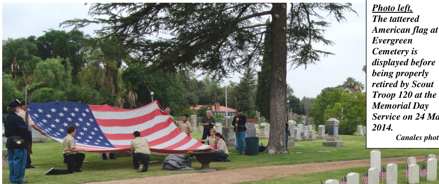
Photo left, The tattered American flag at Evergreen Cemetery is displayed before being properly retired by Scout Troop 120 at the Memorial Day Service on 24 May 2014.

Appomattox Circle of the LGAR will accept donations. If you or your group has a few extra dollars or good appliances or man hours to donate and need a place for your donations to go, Contact the ladies of the Appomattox Circle to see what they need or where you can help.