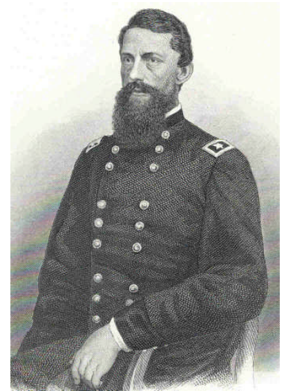
General George Stoneman Jr. Camp 18 Officers