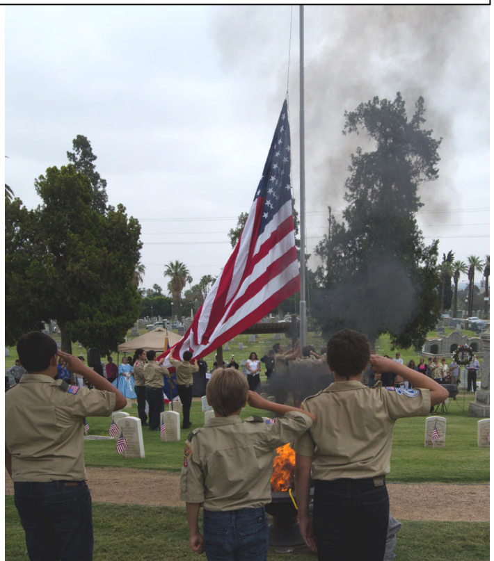
Below: Scouts from Troop 120 of Moreno Valley salute as the new American is hoisted.