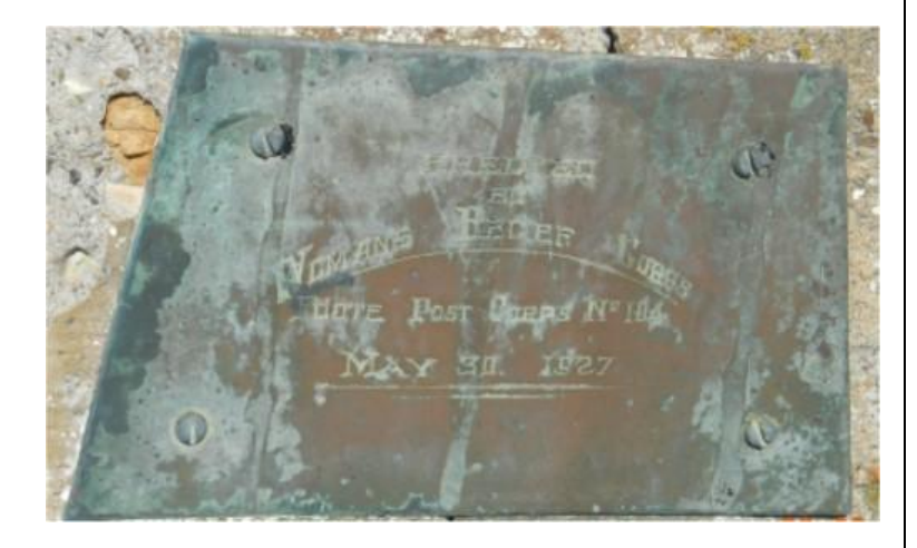
Photo of plaque, courtesy © John Riggs, Carlin Camp 25, 2013. [additional photos needed]