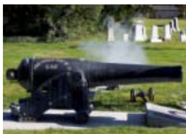
G.A.R. cannon and replica that was just fired