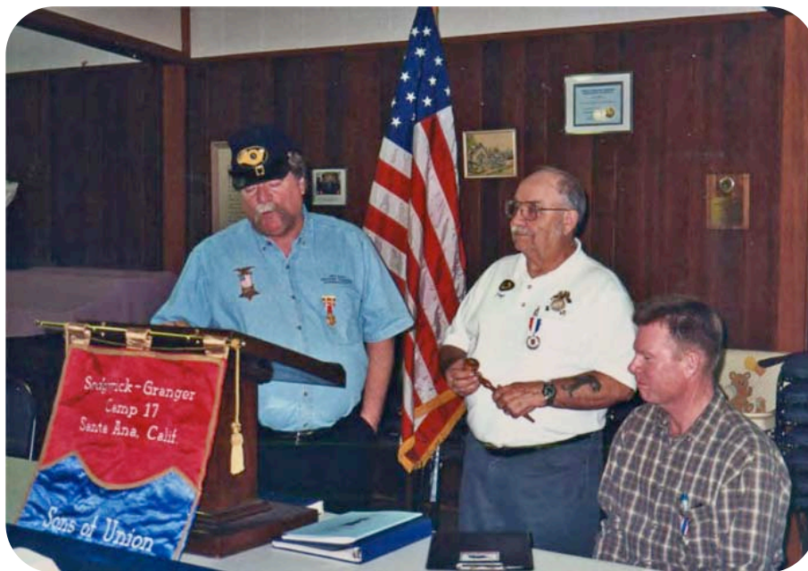
Camp 17 Installation

The Los Angeles County Chief Executive Officer has issued a report providing an update on the Bob Hope Patriotic Hall General Refurbishment Project. The new projected completion date is now November 30, 2011, and improvement of six months over the report that was received January 1, 2009.