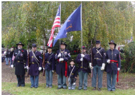
Camp 23, Veterans Day 2011

We have included photos taken at several events in 2011. Enjoy!