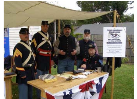
Camp 2 SUVCW Sesquicentennial Signature Event