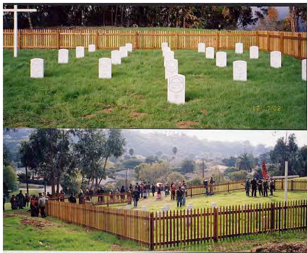
Dedication of 21 Civil War veteran headstones for Company "C" California Native Cavalry Cieneguitas Cemetery, Santa Barbara, CA