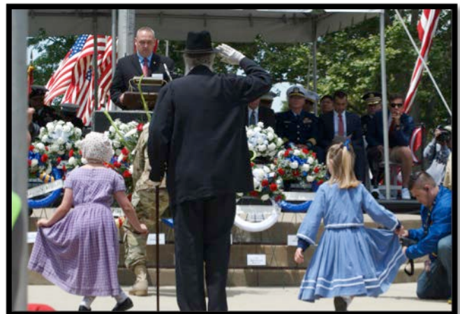
UVC Memorial Day Ceremony, Oak Hill Memorial Park in San José, California