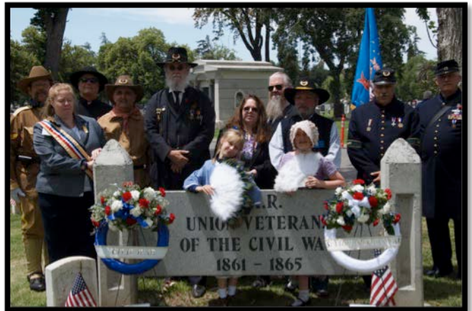
Allied Orders Memorial Day Ceremony, Oak Hill Memorial Park in San José, California