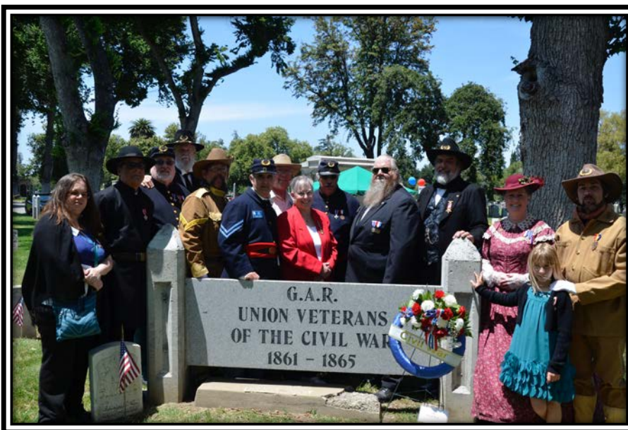
Camp and Auxiliary members at the Grand Army of the Republic plot at Oak Hill Memorial Park