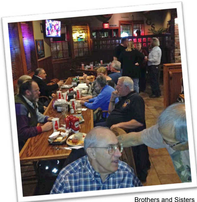
Brothers and Sisters enjoyed an evening of camaraderie