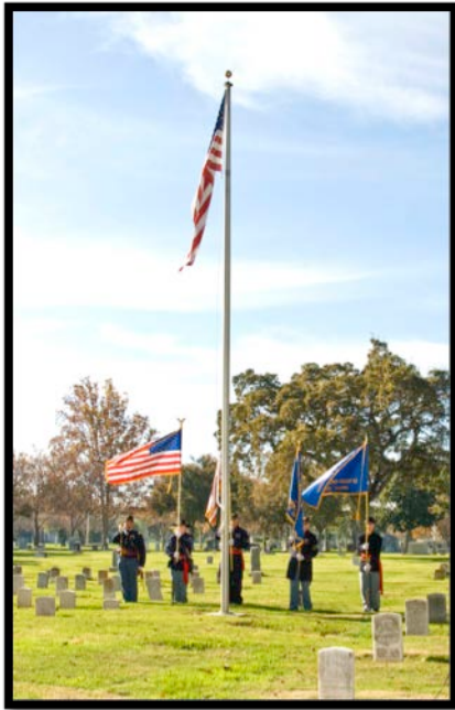
The Color Guard presents the colors