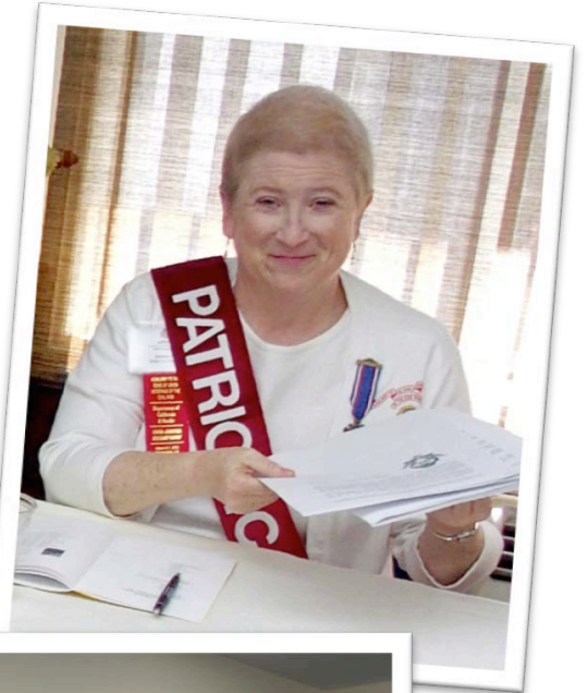
Below: The Sisters make a visit en masse to the Sons' meeting.