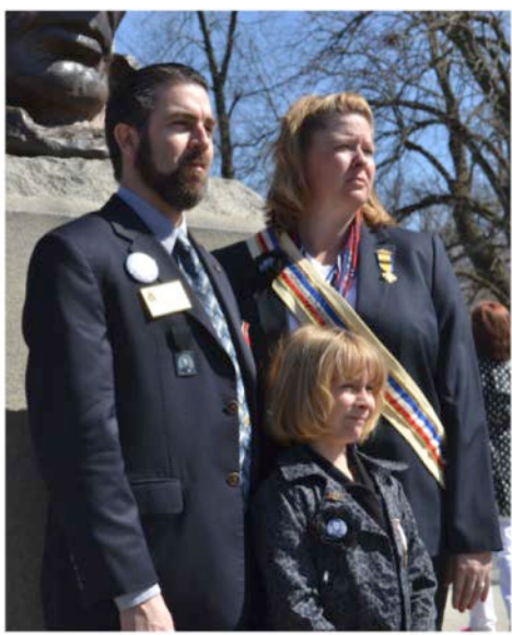
Lincoln Tomb Ceremony, Springfield, IL