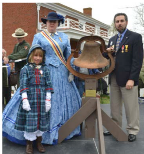
Bells Across the Land Ceremony, Appomattox Court House, VA