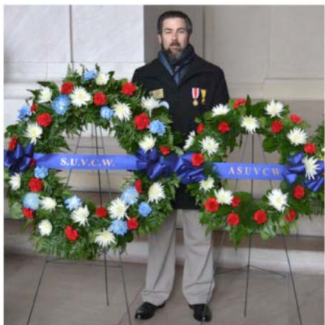
Lincoln Birthday Commemoration, Washington, DC