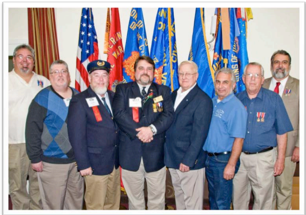
Elected Officers of the Department of California and Pacific, SUVCW pose with the Commander-in-Chief

The date and location of the 2015 Department Encampments has yet to be announced, but the editor understands that Sacramento is a leading candidate.