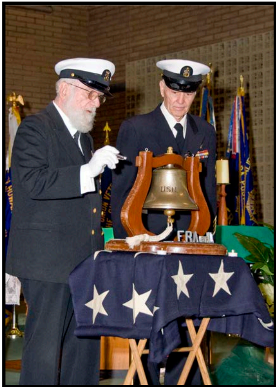
Members of the Fleet Reserve Association conducted a moving "Two-Bell Ceremony"