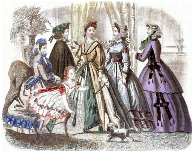
Godleys Fashions for August 1862