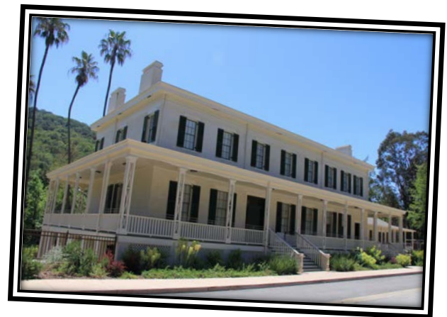
La Casa Grande, now the home of the New Almaden Quicksilver Mining Museum