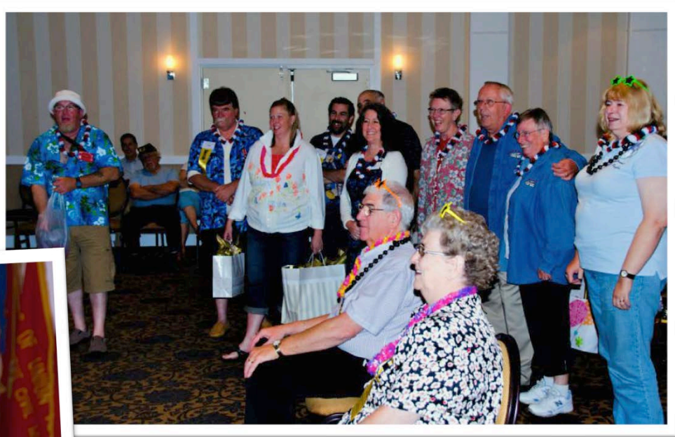
Above: The Department Delegation at the Courtesy Hour.

A Special Committee on Government Headstone Applications was formed to assist Brothers with obtaining military headstones for Civil War veterans. The committee will expire at the close of the 2016 National Encampment, unless continued or made a standing committee.