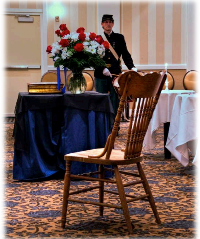
"The Vacant Chair" — The Encampment opened with a joint memorial service and opening ceremony.