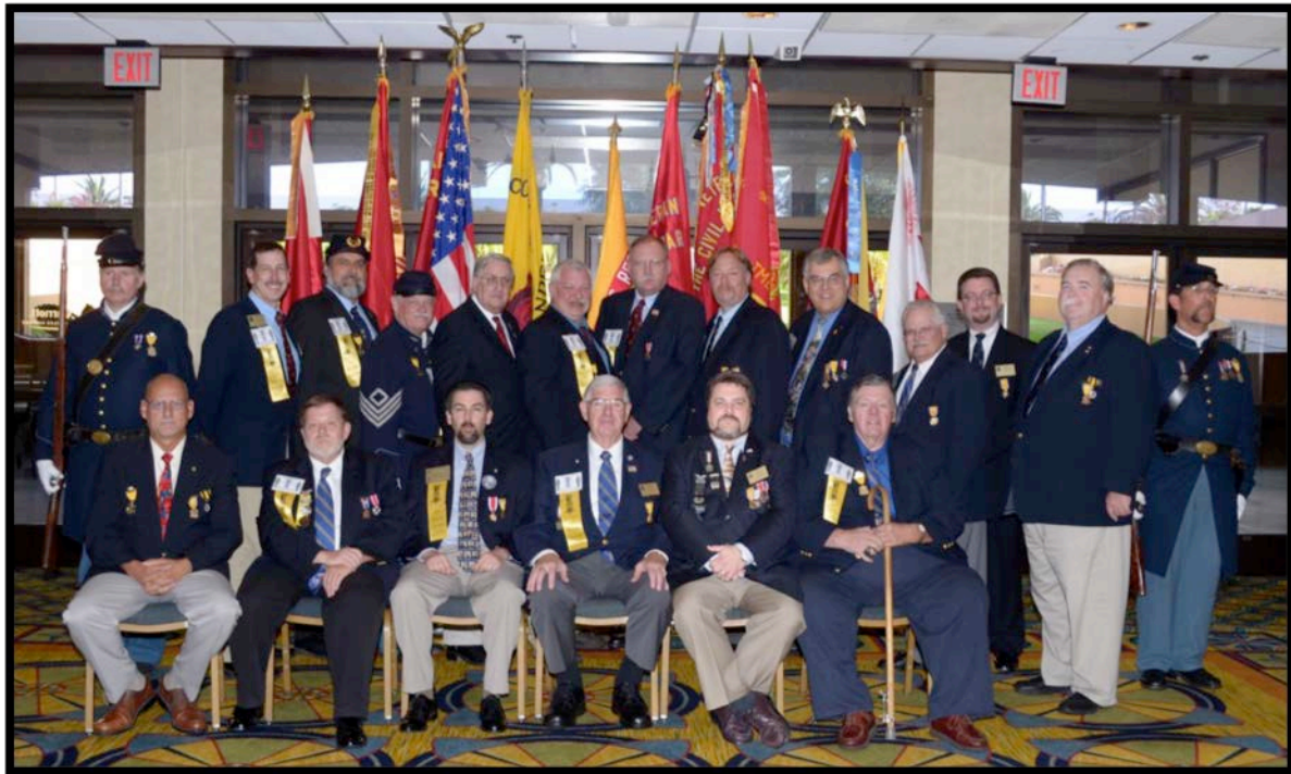
The newly elected and appointed SUCVW National Officers

For the first time in 39 years, the Department of California and Pacific was honored to host the annual National Encampments of the Allied Orders of the Grand Army of the Republic. The Encampments took place at the Los Angeles Airport Marriott on August 9-11, 2012. All of the Allied Orders were present with the exception of the Woman's Relief Corps, which was previously committed to meet in Springfield, Illinois.