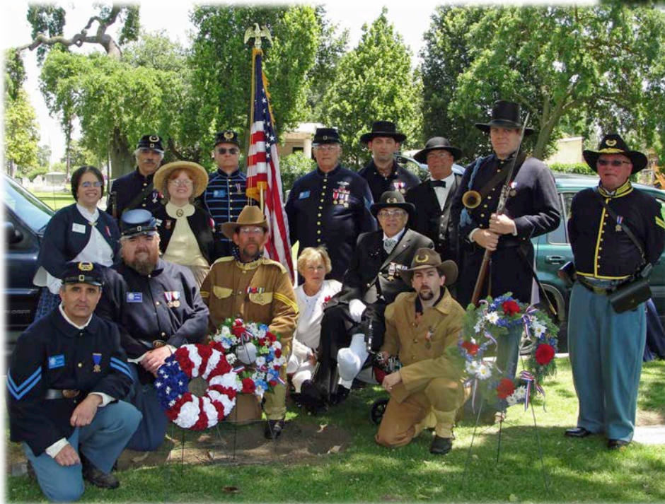
The Camp and Auxiliary pose for a picture at the G.A.R. plot at Oak Hill Memorial Park.