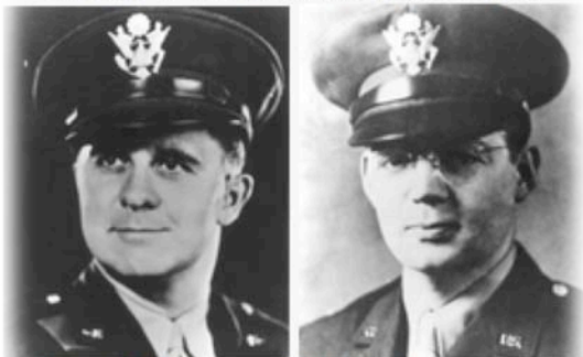
Clark V. Poling, John P. Washington

The annual Four Chaplains Inter-Faith Memorial Service was held on February 5, 2011 at St. Francis Cabrini Church in San José, California.