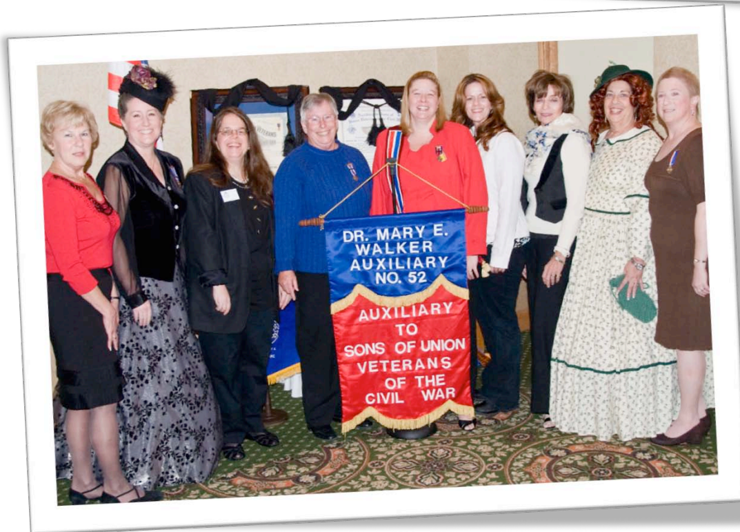
Sisters of Auxiliary No. 52