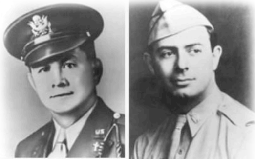
George L. Fox, Alexander D. Goode