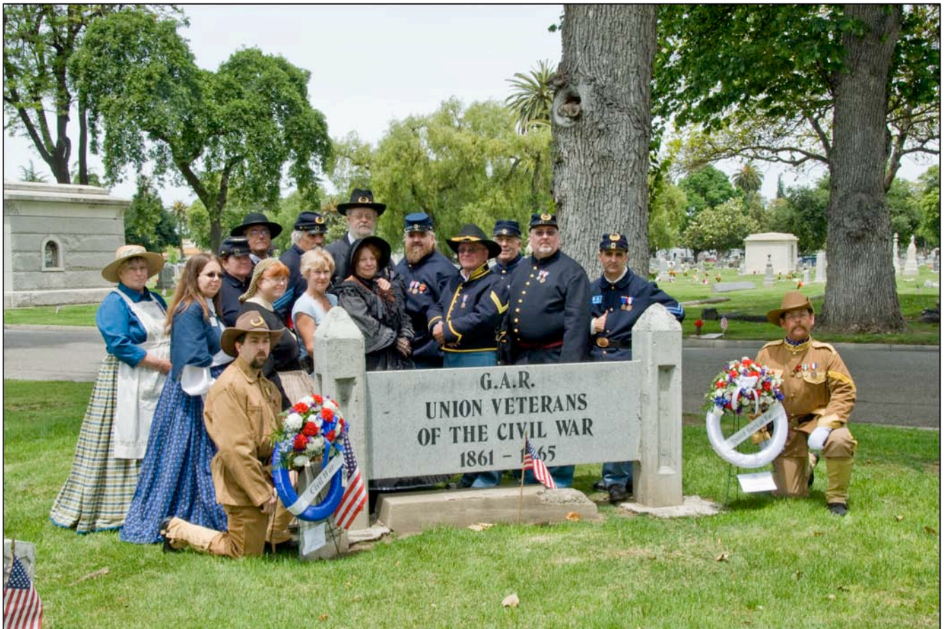
Members of the Camp and Auxiliary pose at the G.A.R. burial plot at Oak Hill Memorial Park on Memorial Day.