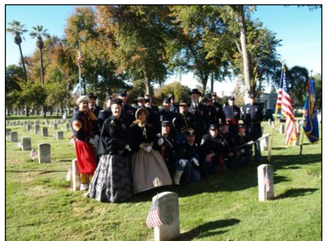
Participants pose for a picture after a successful ceremony.