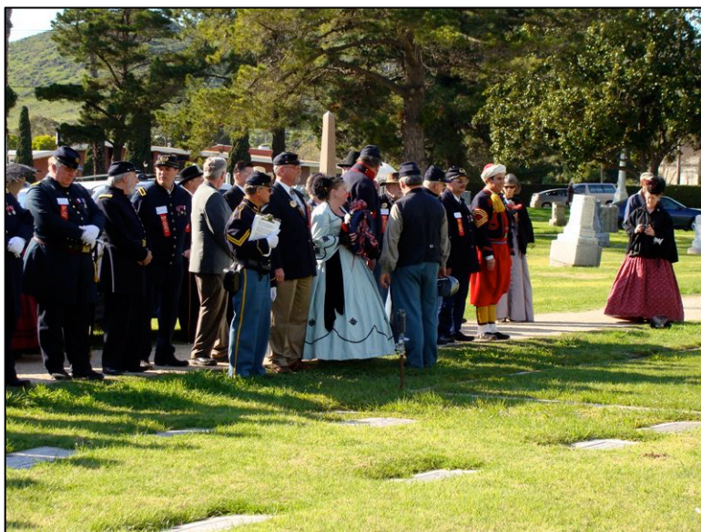
Sons & Auxiliary gather at the GAR plot for a memorial service.

After a brief period of inactivity, the Auxiliary's Department of California and Pacific is back in action! The Department, which was established in 1910, held its annual Encampment in conjunction with that of the Sons' Encampment. Much of the business session was used to instruct the newer Sisters on the fundamentals of the Auxiliary,