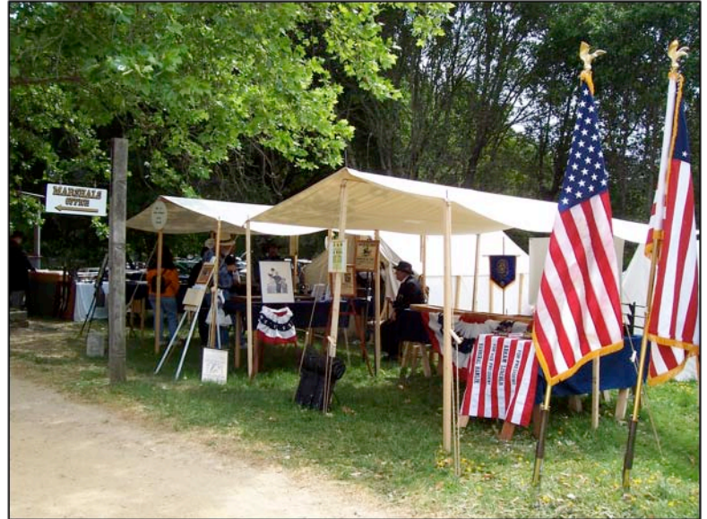
The impressive combined information booth of Camps 4, 10, and 24 at Roaring Camp