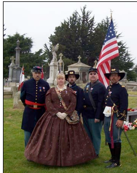
Sons of Confederate Veterans ceremony at Colma on April 29th.