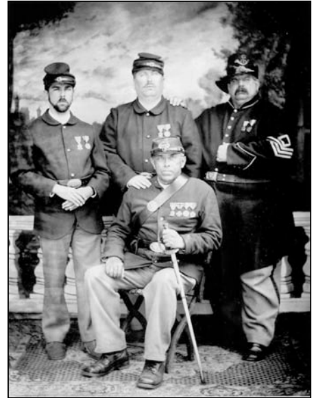
Ardenwood Farm, Fremont, Cal. Memorial Day 2001

(If one hasn't heard the stories, be sure to ask around about the "Folding Chair Incident" at Ardenwood or the "Battle of the Porta-Potty" in Montana!)