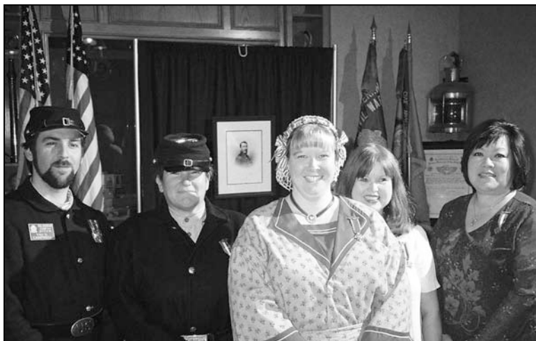
Dr. Mary E. Walker Auxiliary No. 52 Officers for 2005