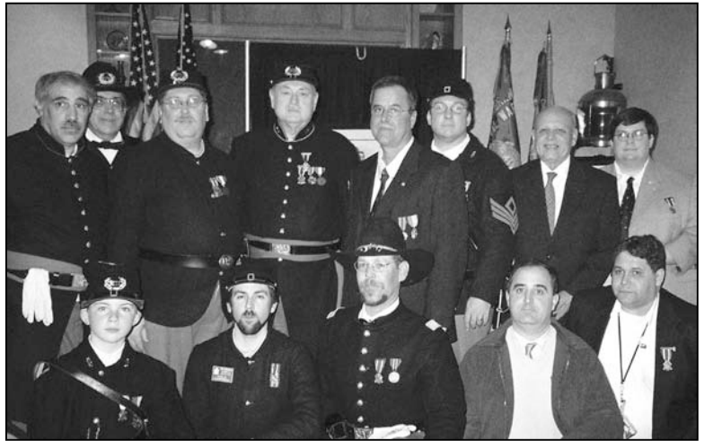
Phil Sheridan Camp 4 Officers for 2005