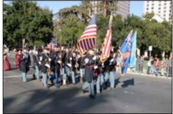
Color Guard passes by the reviewing stand