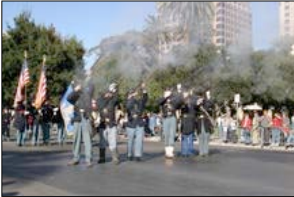
Six-member firing detail gives their salute