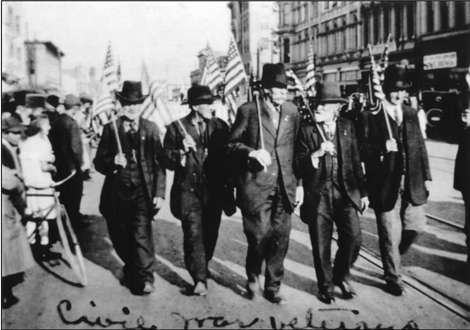
Members of the GAR marching in the first Veterans Day Parade in downtown San José – 1918