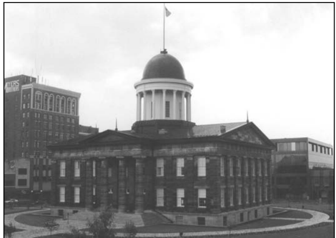
Old Illinois State Capitol built in 1837. Lincoln delivered his famous "House Divided" speech here in 1858. After his death, 75,000 people viewed his body here as it lay in state.