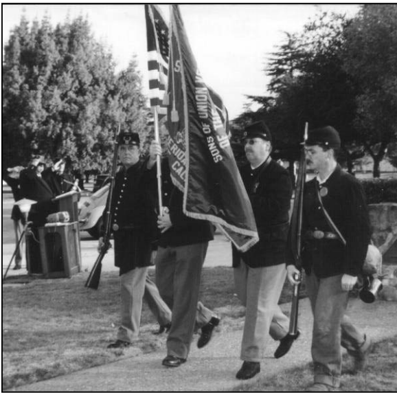
Camp Color Guard Retires the Colors

Over the course of the month prior to ceremony, the flag at the cemetery is lowered each day in honor of a particular veteran. The veteran does not have to be interred at Oak Hill.