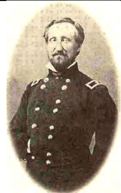
Gen. W. S. Rosecrans

Newsletter of Gen. William S. Rosecrans Camp No. 2, SUVCW – Los Angeles & Ventura Counties.