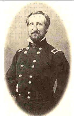
Gen. W. S. Rosecrans

Newsletter of Gen. William S. Rosecrans Camp No. 2, SUVCW – Los Angeles & Ventura Counties.