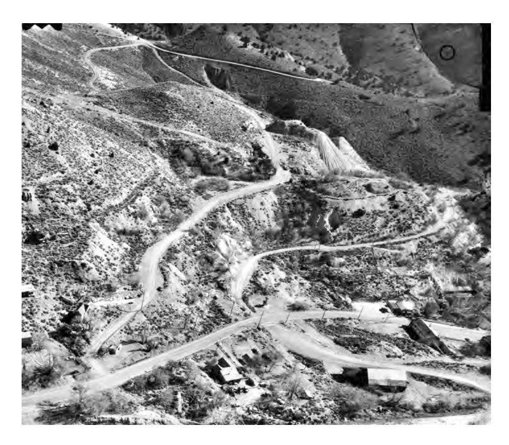
Aerial photograph of Fort Homestead, which is right of center with north approximately to the left (Nevada Department of Transportation, NDOT 1365, frame 6-5, Nov. 30, 1979).