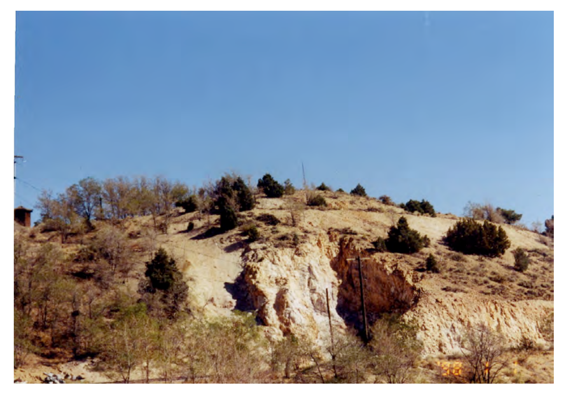
Photograph of Fort Homestead from the northwest looking southeast. Linear cut near top of hill is old carriage road.