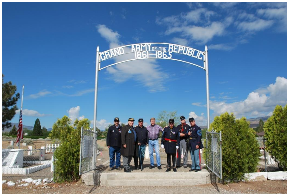
Camp 25 Members with Congressman Mark Amodei