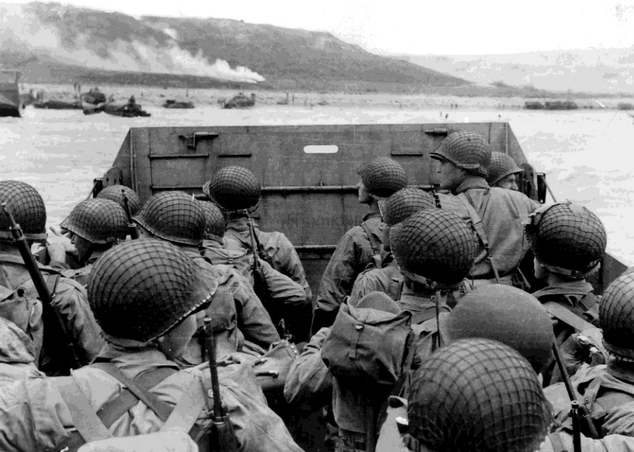
U.S. troops in a landing craft getting ready to land at Omaha beach at Normandy, June 6th, 1944.

In the end Allied Forces suffered approx. 10,000 casualties (with 4,414 were killed in combat), but were successful in the invasion and were able to knock out Adolf Hitler's regime almost a year later. The Germans lost between 4,000-5,000 troops, along with losing major defense weapons and the battle. The significance to this is that the United States spearheaded the invasion, and they pushed Hitler's forces back to Germany even though the Soviet Union captured Berlin in the end.