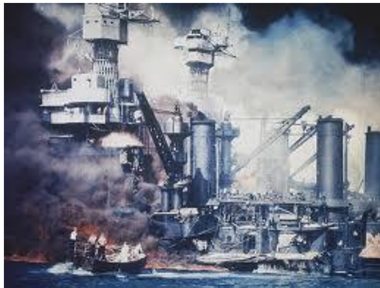
U.S.S. West Virginia after being bomber by Japanese Zero's.

On December 7, 1941 at 7:38 a.m. Hawaiian time 414 Japanese Zero's attacked the U.S. Naval base at Pearl Harbor, Hawaii, sinking two U.S. battleships and damaging at least a dozen others, the U.S. suffered 3,500 casualties while only 64 Japanese were killed, in his joint speech to Congress President Franklin Delano Roosevelt said that it was "a day that would live in infamy" and shortly thereafter the United States declared war on Japan and its allies entering World War II. It was the second time that the United States had ever been attacked on its own soil by a foreign power.