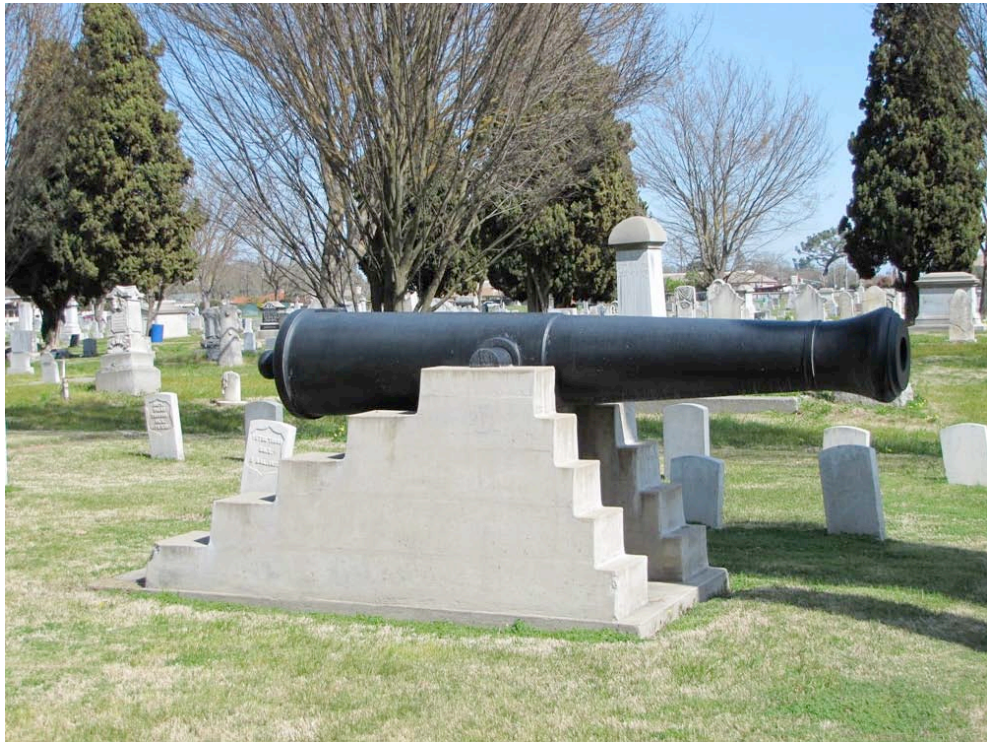
Cannon in GAR Grant Post No. 9 Cemetery Plot, Modesto, California.