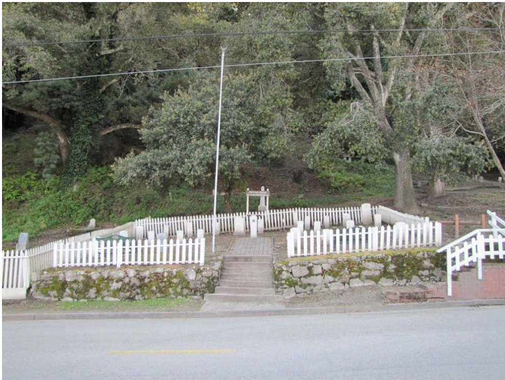
GAR Wallace-Reynolds Post No. 32 Cemetery Plot, Santa Cruz, California.