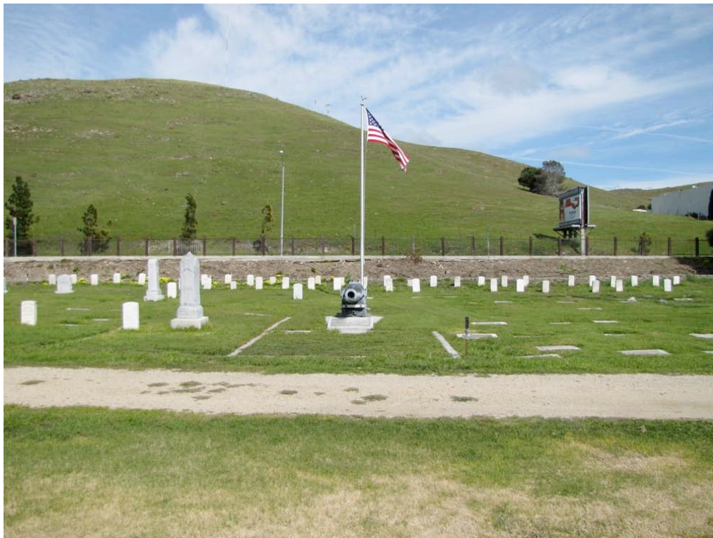
GAR Fred Steele Post No. 70 Cemetery Plot, San Luis Obispo, California.