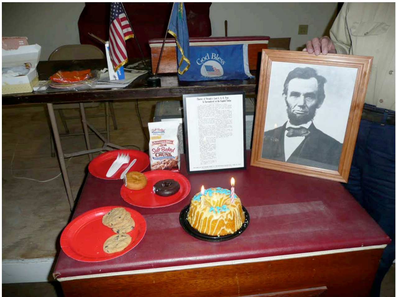
The guest of honor and his cake.

President Abraham Lincoln's 200th birthday was February 12, 2009. After the February meeting, Carlin Camp 25 held a little birthday party with a cake and snacks. The following are a couple of pictures of the festivities.