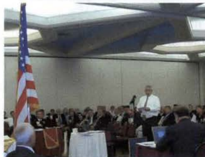
SUVCW Officers and Delegates "in action" during the 124 th Annual National Encampment recently held in Nashua, New Hampshire.

It was reported that over 500 delegates and guests attended the 124 th Annual Encampment that covered three days of events hosted by the SUVCW - Department of New Hampshire. Good job !!