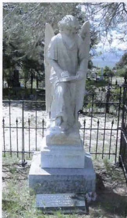
The above is the monument dedicated to Johana Shine , a Union Civil War Nurse (located in the cemetery west of the Town of Austin, Nevada, along US-50).