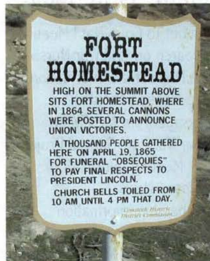
Fort Homestead , a Civil War era Union Army military facility established in Northern Nevada (the above historical marker is located along the east shoulder of SR- 342 in the Town of Gold Hill, Nevada).

Although it never saw action against "Rebel Forces", it served as a deterrent and symbol of Union solidarity in the West.