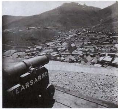
An 1860s view from Fort Homestead looking south toward the Town of Gold Hill, Nevada.