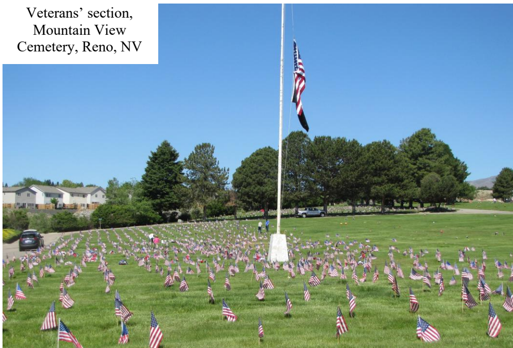
Veterans' section, Mountain View Cemetery, Reno, NV