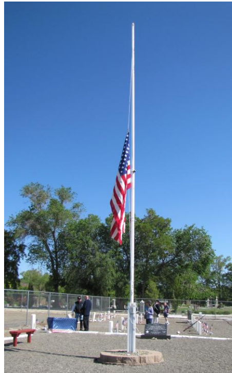
Flagpole, G.A.R. General O.M. Mitchel Post 69 Cemetery.