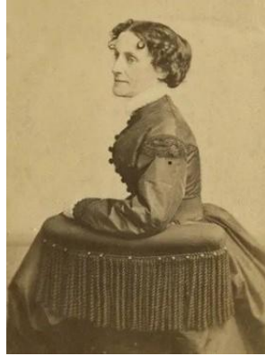
Elizabeth Van Lew 1818-1900