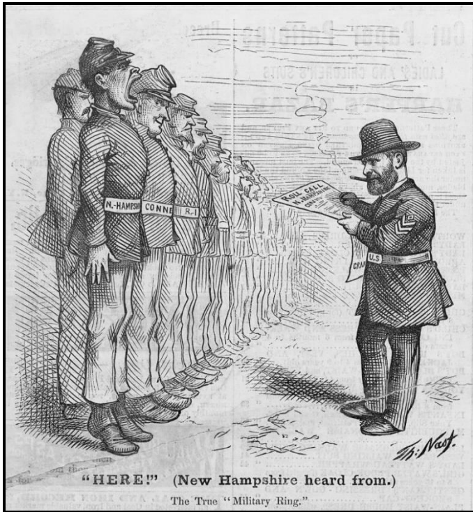
"HERE!" (New Hampshire heard from.) The True "Military Ring."