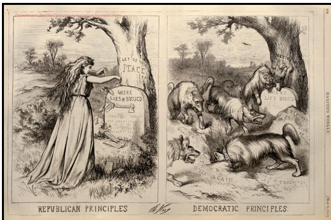
"Let us have Peace" -Harpers Weekly, May 1871