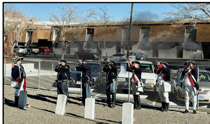
Firing a Salute to our Civil War Brothers