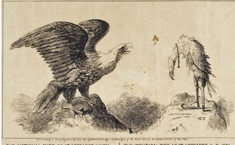
OUR NATIONAL BIRD AS IT APPEARED WHEN THE IDENTICAL BIRD AS IT APPEARED A.D. 1861 HANDED TO JAMES BUCHANAN MARCH 4.1857.