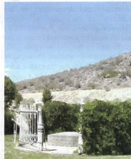
The Grand Army of the Republic Civil War Monument at the Lone Mountain Cemetery, Carson City, Nevada, has been disassembled and transported to a refurbishing facility in Ohio. It is the first time in over 113 years the sentinel atop the monument will not be "on picket duty" at the Civil War Unknown Soldiers section of the cemetery.