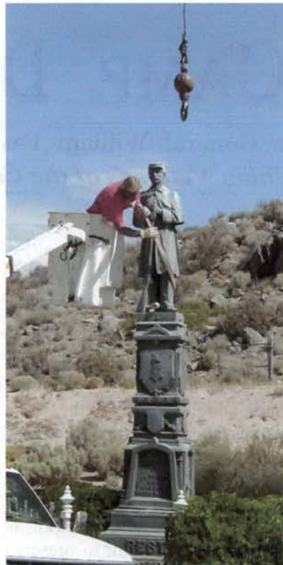
Crews begin work on the top section of the GAR Civil War Monument in preparation of the first phase of the restoration project.

Karkadoulis Bronze Art, Inc., is one of the leading monument restoration companies in the