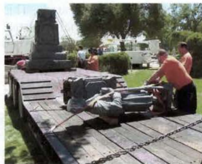
Crews carefully secure the disassembled sections of the GAR Civil War Monument for transportation to the Karkadoulis Bronze Art Foundry in Ohio.

It should be noted, that while this much needed restoration is being performed, it will be the first time in 113 years that the sentinel atop the GAR Monument will not be standing guard over Nevada's largest assemblage of Civil War Veterans !!