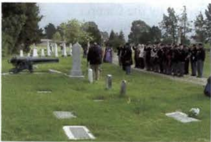
Uniformed and non-uniformed members of the SUVCW - Dept. of Calif. and the Pacific gather at the GAR Cemetery in San Luis Obispo, for a memorial service.

At 2:00 PM the business meeting reconvened. During which was the reading of the remaining reports, by-law proposals and the election of officers.