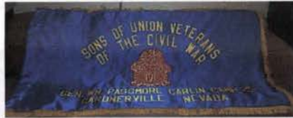
The General William Passmore Carlin Camp No. 25's new flag !!