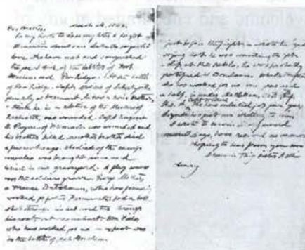
The above is a copy of an original Civil War letter written in 1862 from the private collection of the Editor.