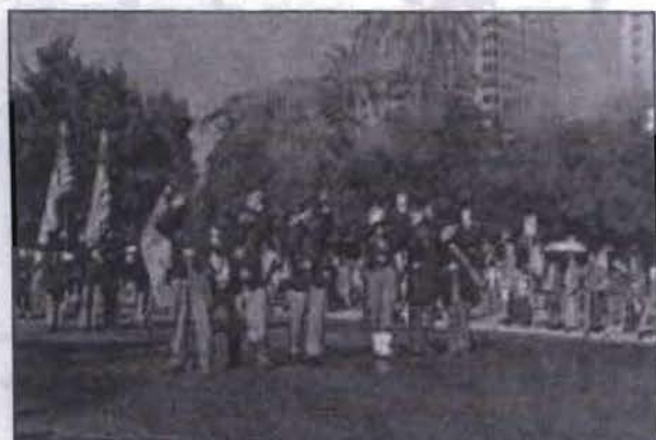
Six-member firing detail gives their salute