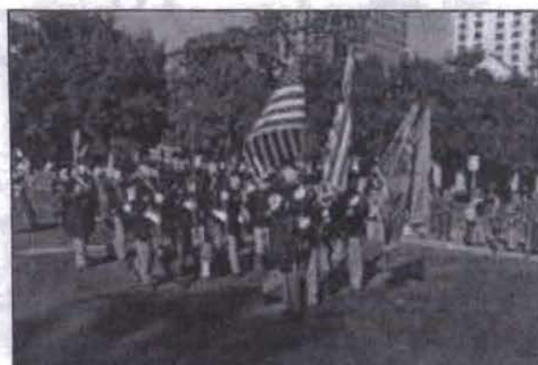
Color Guard passes by the reviewing stand